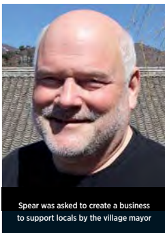
Spear was asked to create a business to support locals by the village mayor

Where did you get the idea to develop The Schoolhouse? Not long after I moved to Mutianyu full-time, the mayor called me to the village hall and gave me a lecture - the community had a declining and ageing population, low incomes and