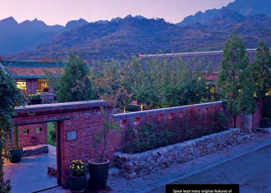
Spear kept many original features of the brick kiln in the spa including red bricks (above) and glazed tiles (left)