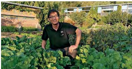
The Brickyard supports the Slow Food movement and meals are based on homegrown produce

which launched last year. I have a passion for design and as well as the Brickyard, I've refurbished dozens of homes in or near Mutianyu including nine that we rent out. After these were featured in